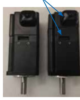
Rev A Rev M

Power and feedback connectors in slightly different location