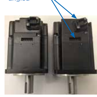
Rev A Rev M

Power and feedback connectors in slightly different location with feedback connector angled